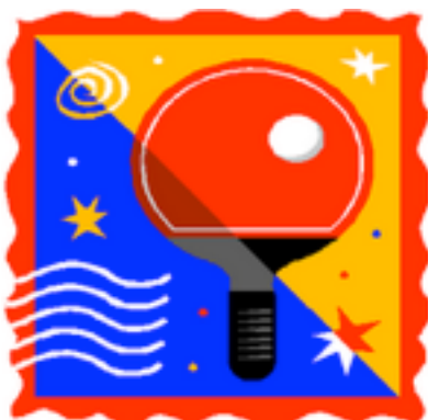
TABLE TENNIS CLUB

Free lessons for men & women: Thursdays 8:00A - 12:00 noon